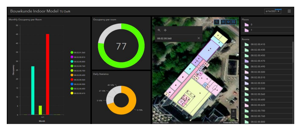
Figure 2: ArcGIS Online Dashboard

are the Unique MAC numbers and their corresponding RSSI values. The y-variable is the label containing the rooms name from which a particular MAC number and a RSSI was obtained. For the test data-set, only the x-variables need to be created, which should be in the same format as the training data-set, so a unique MAC identifier and RSSI values are needed. To prepare the x-variables for the test data, the MAC addresses are matched to the fingerprint MAC addresses and the unique number assigned to a MAC in fingerprint is given to matching MAC addresses from the test data-set. If a MAC in test data cannot be found in fingerprint data, it is discarded along with its RSSI values, as that particular MAC address would not help us in matching. The y-variable in the case of the test data-set is supposed to be our final label for the room to locate the user's position.